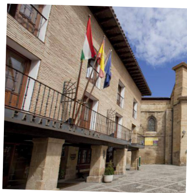
Parador Santa Domingo de la Calzada

Built in 947, this former convent was once the court of kings in the middle ages and was refurbished to include a Gothic Cloister in the 16th century. The expansive gardens around the hotel ensure a quiet, restful sleep.