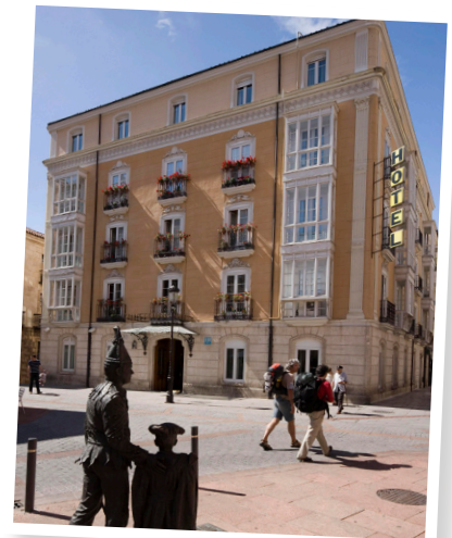
Hotel Norte Y Londres